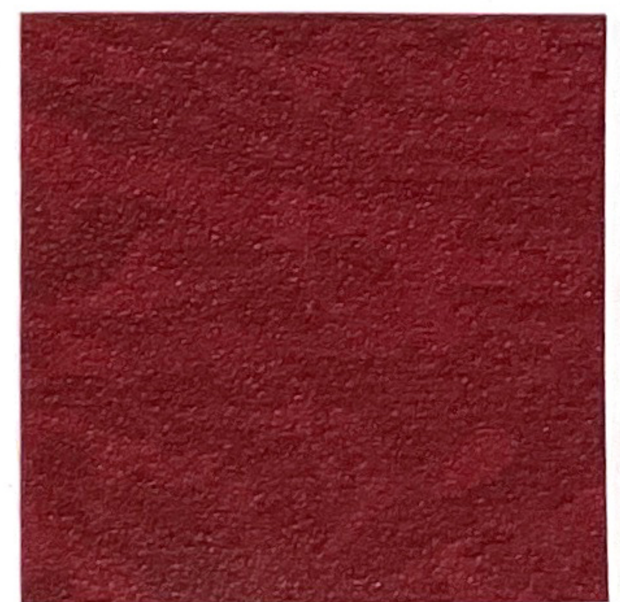
MS 74 Burgundy