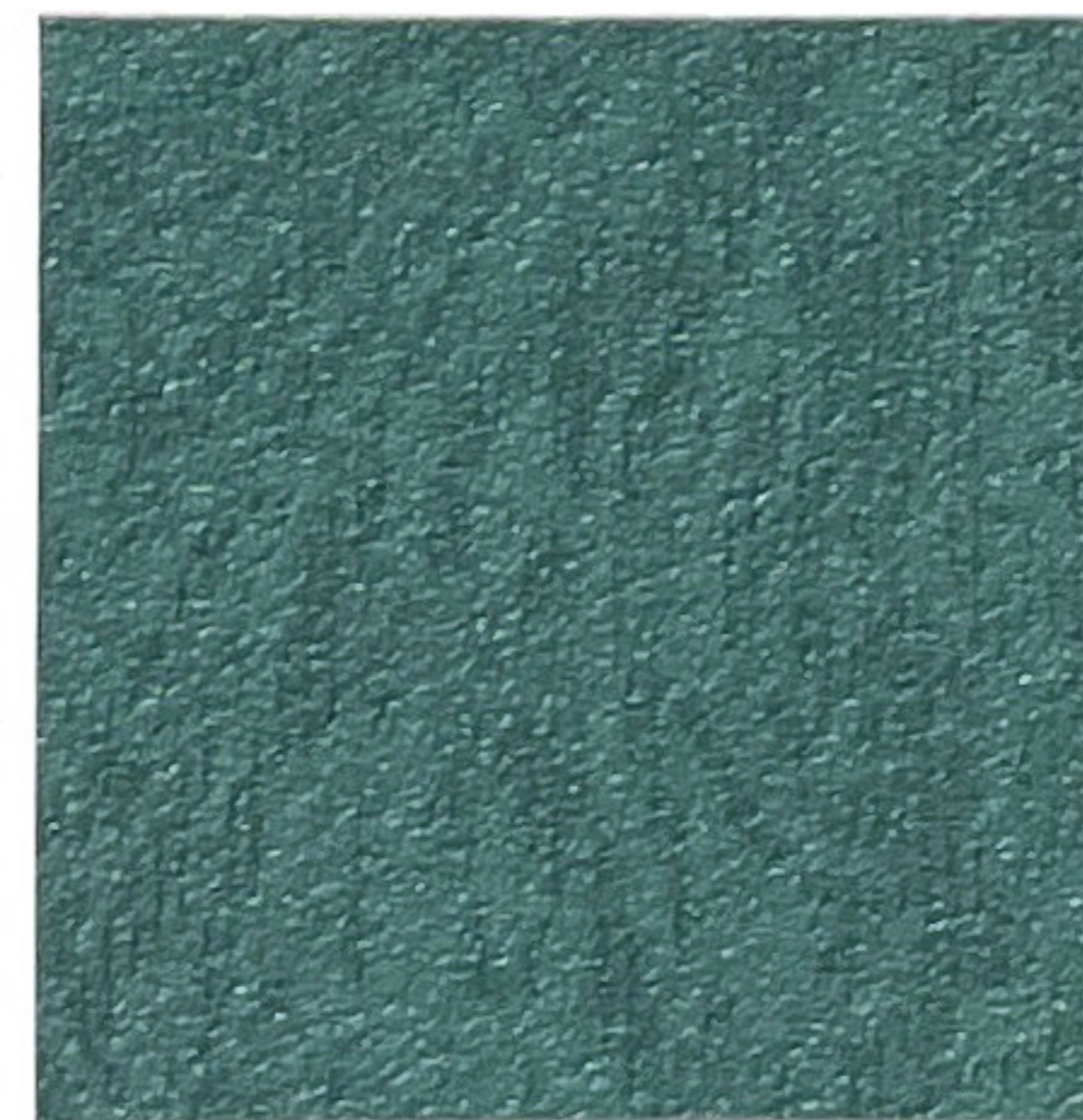
MS 65 Pine Forest