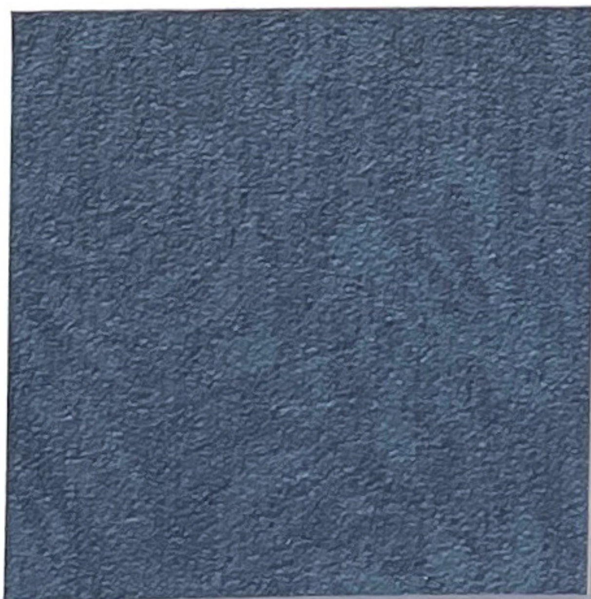
MS 68 Wedgewood