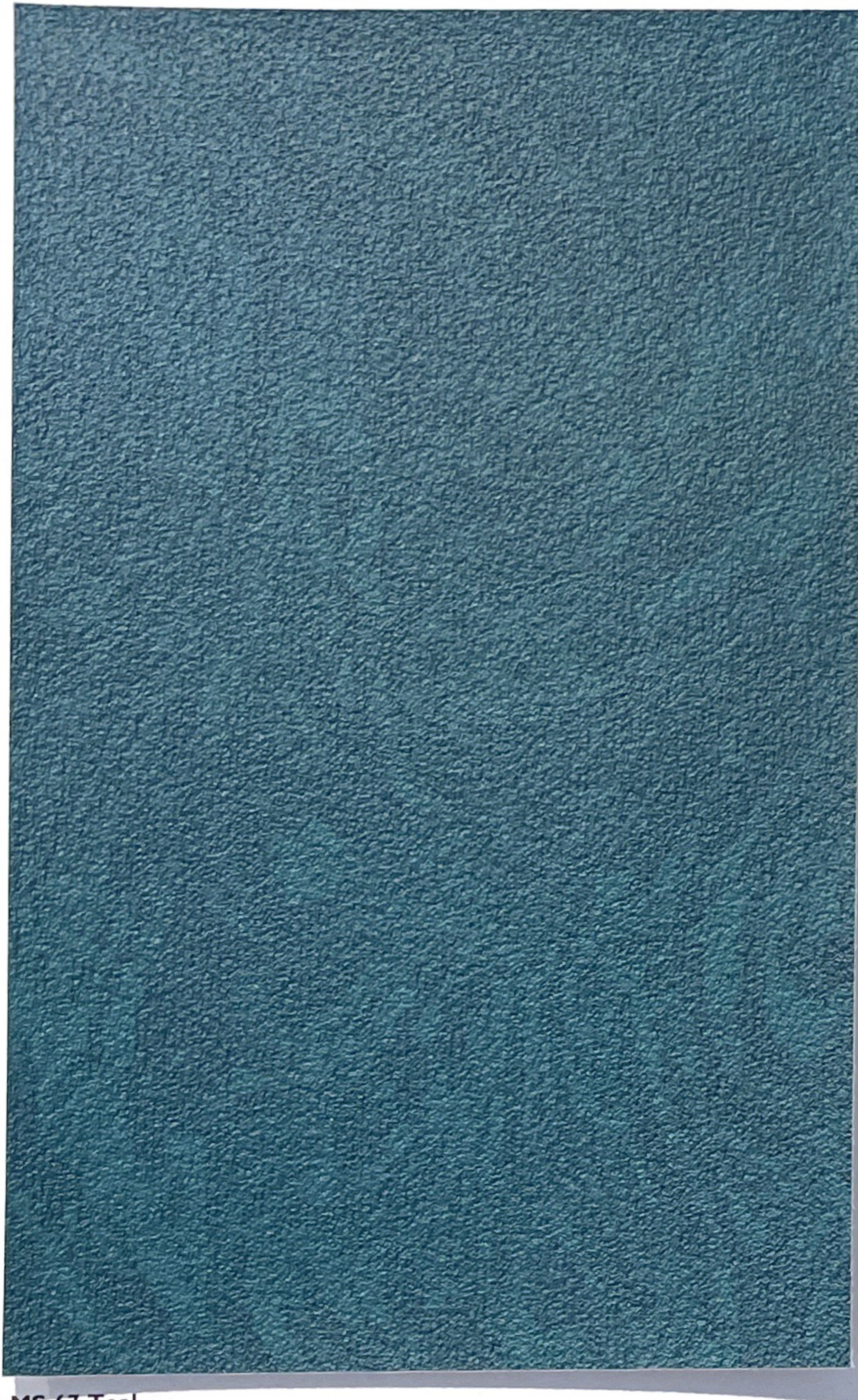
MS 67 Teal