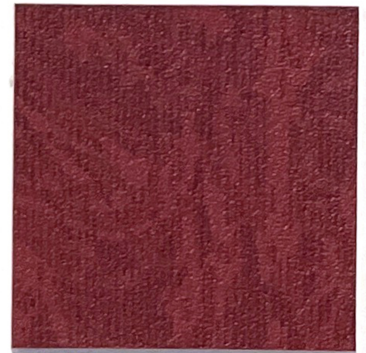
MS 73 Port