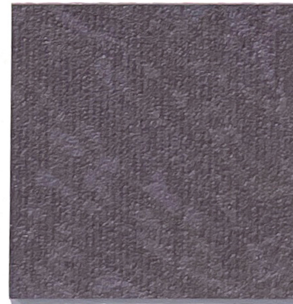
MS 71 Plum