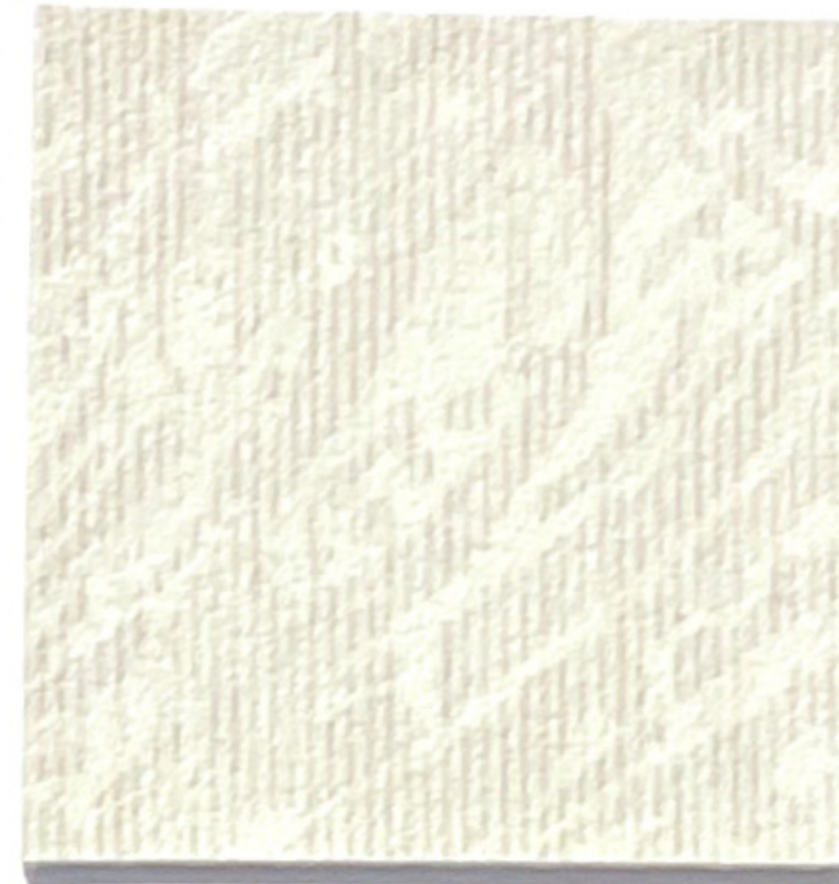
MS 60 Winter Snow