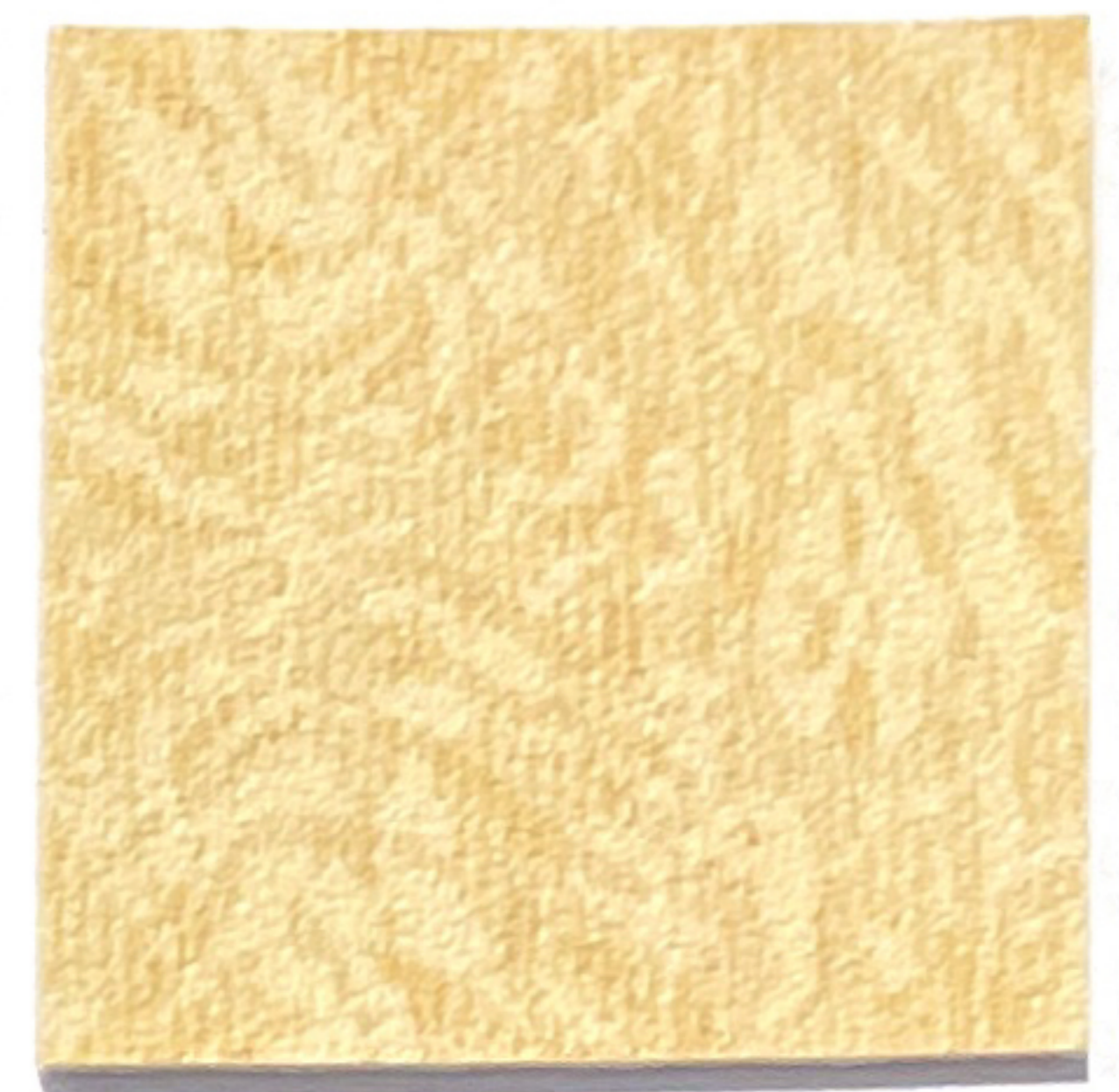
MS 61 Harvest