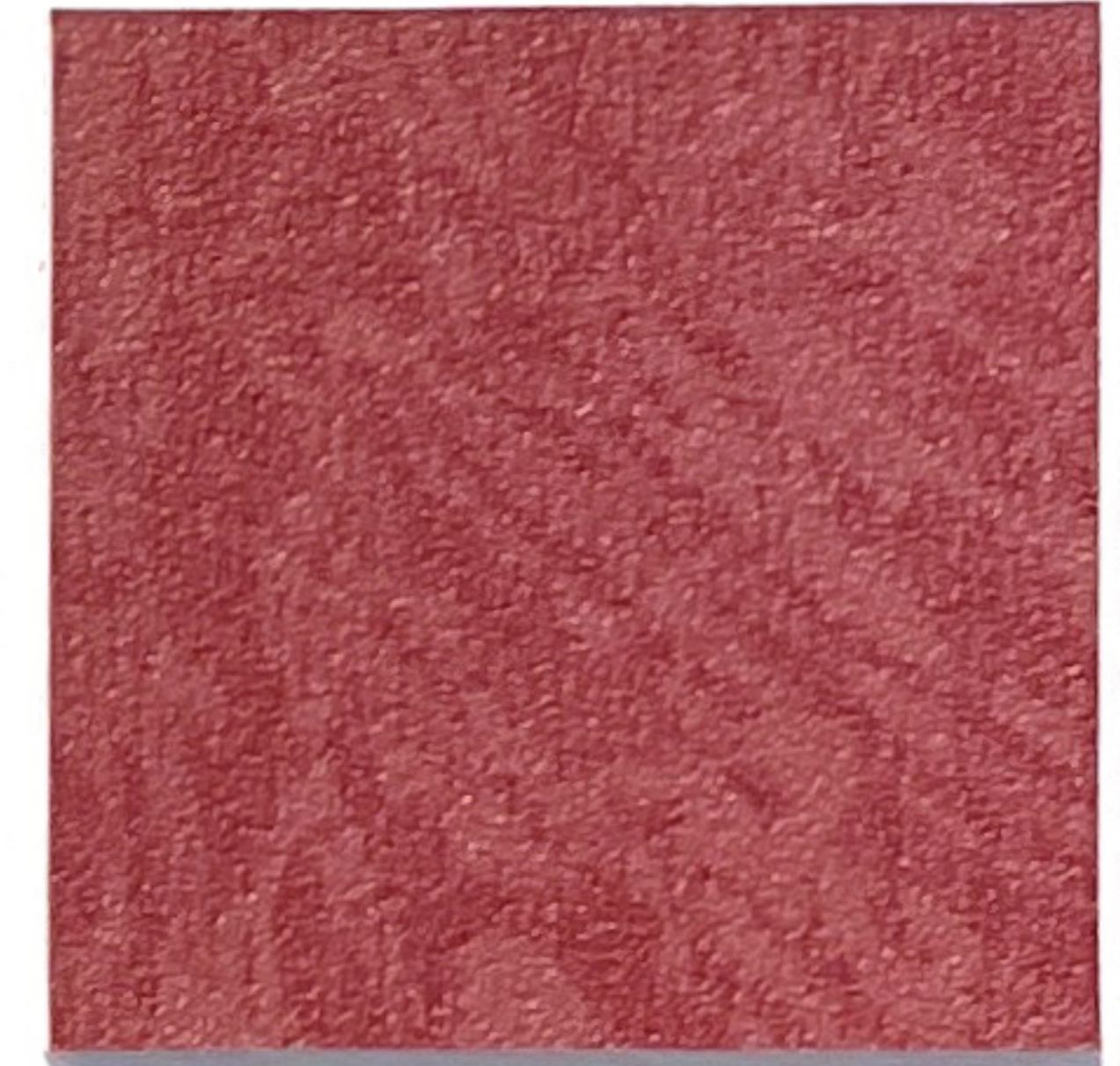
MS 72 Quarry Red