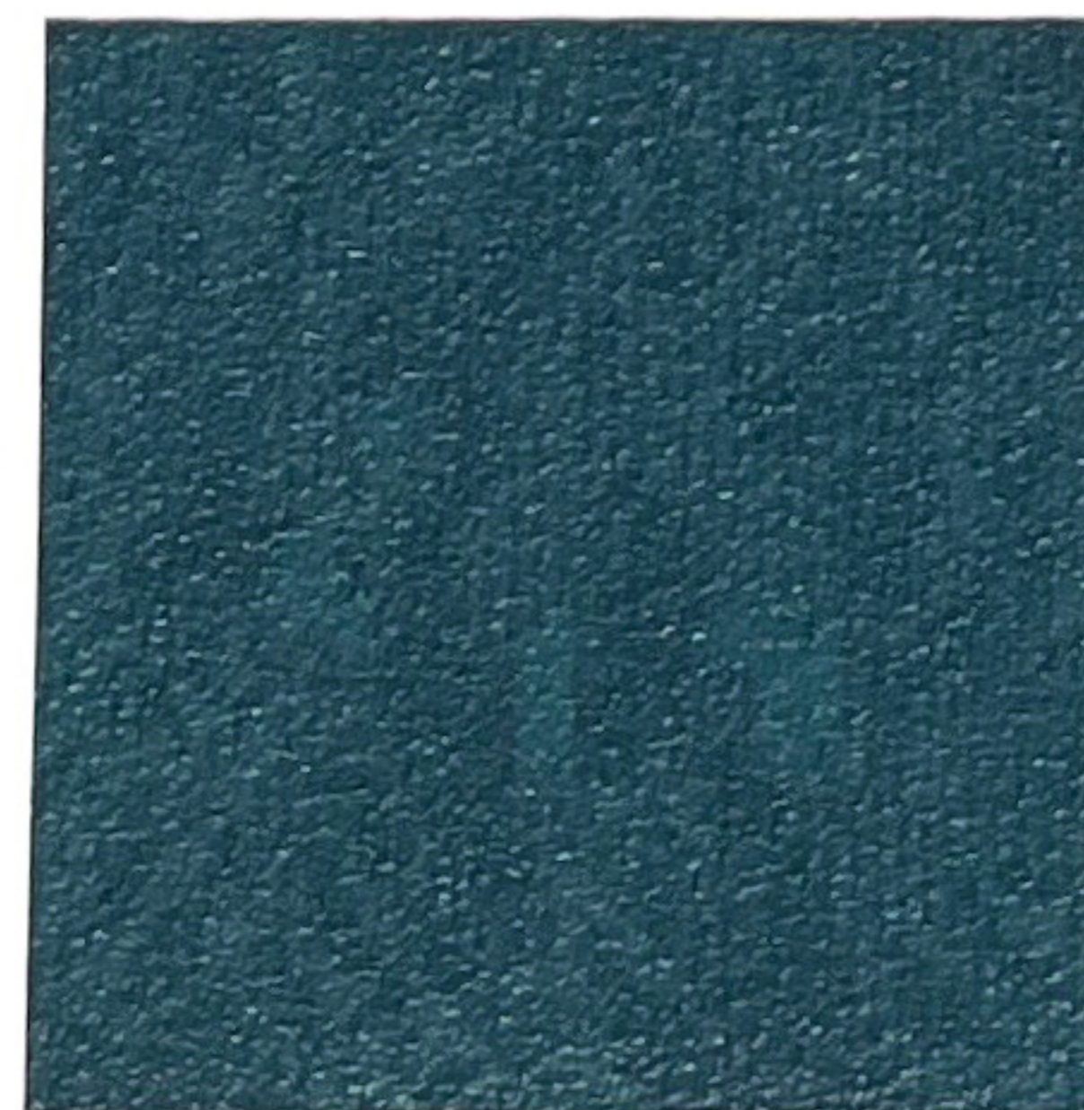
MS 66 North Woods