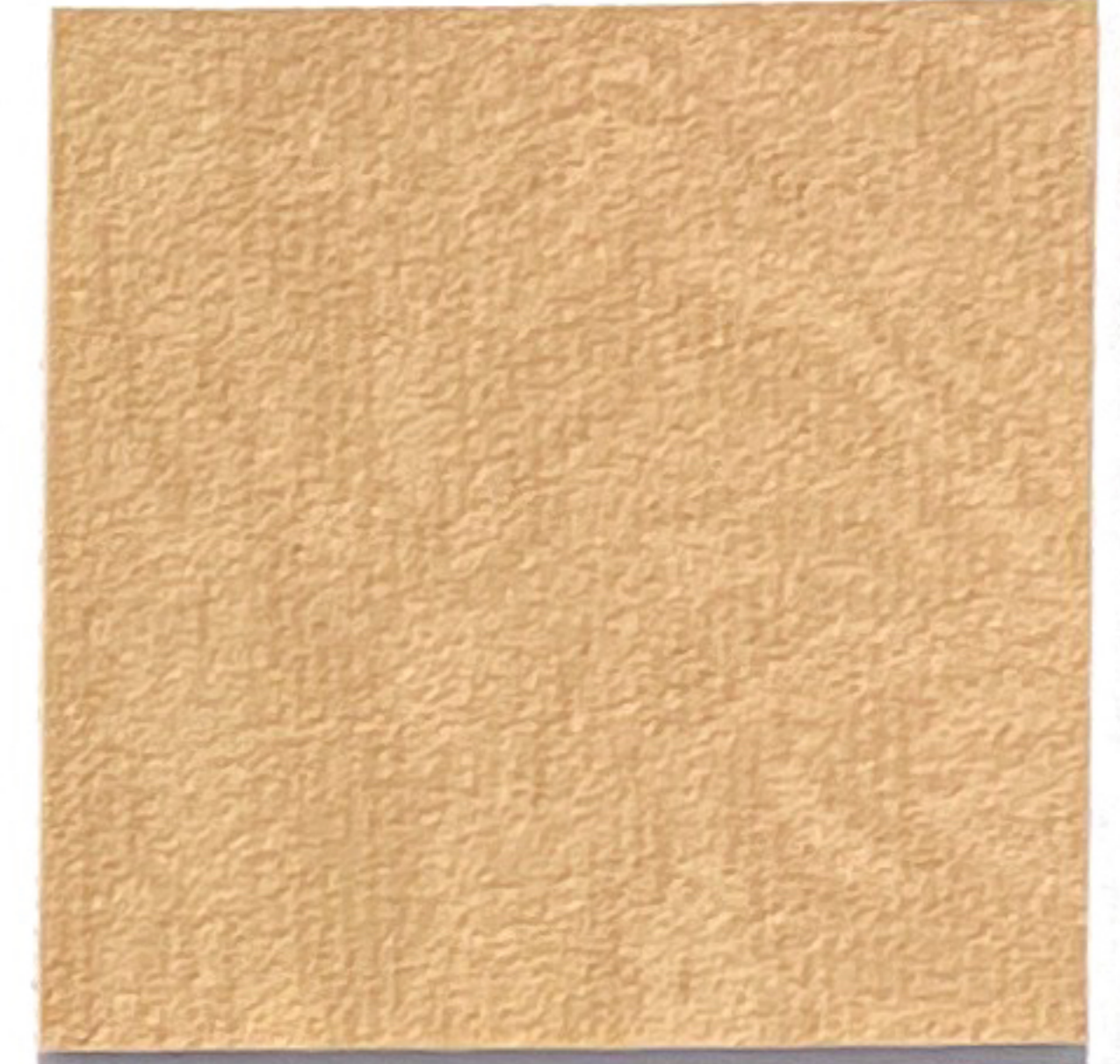
MS 63 Sunstraw