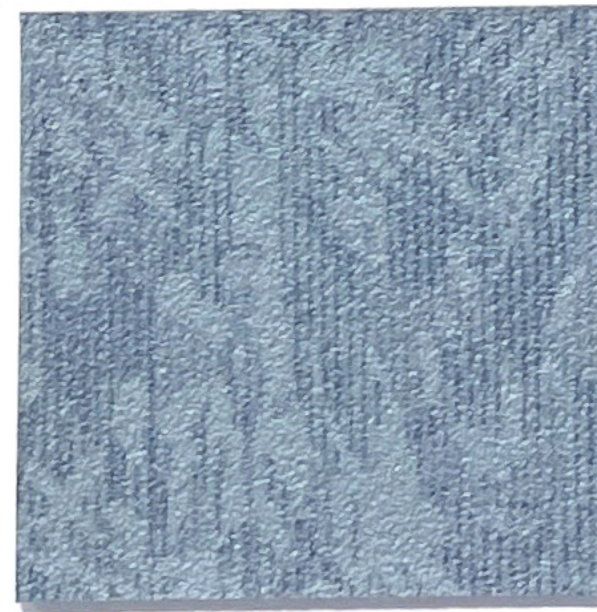
MS 69 Misty Blue