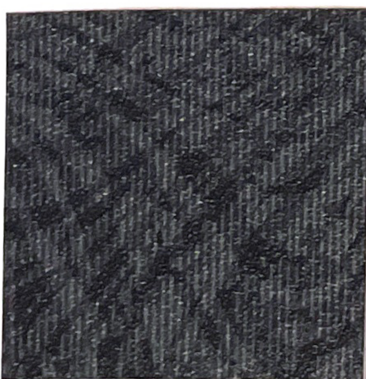
MS 70 Ebony