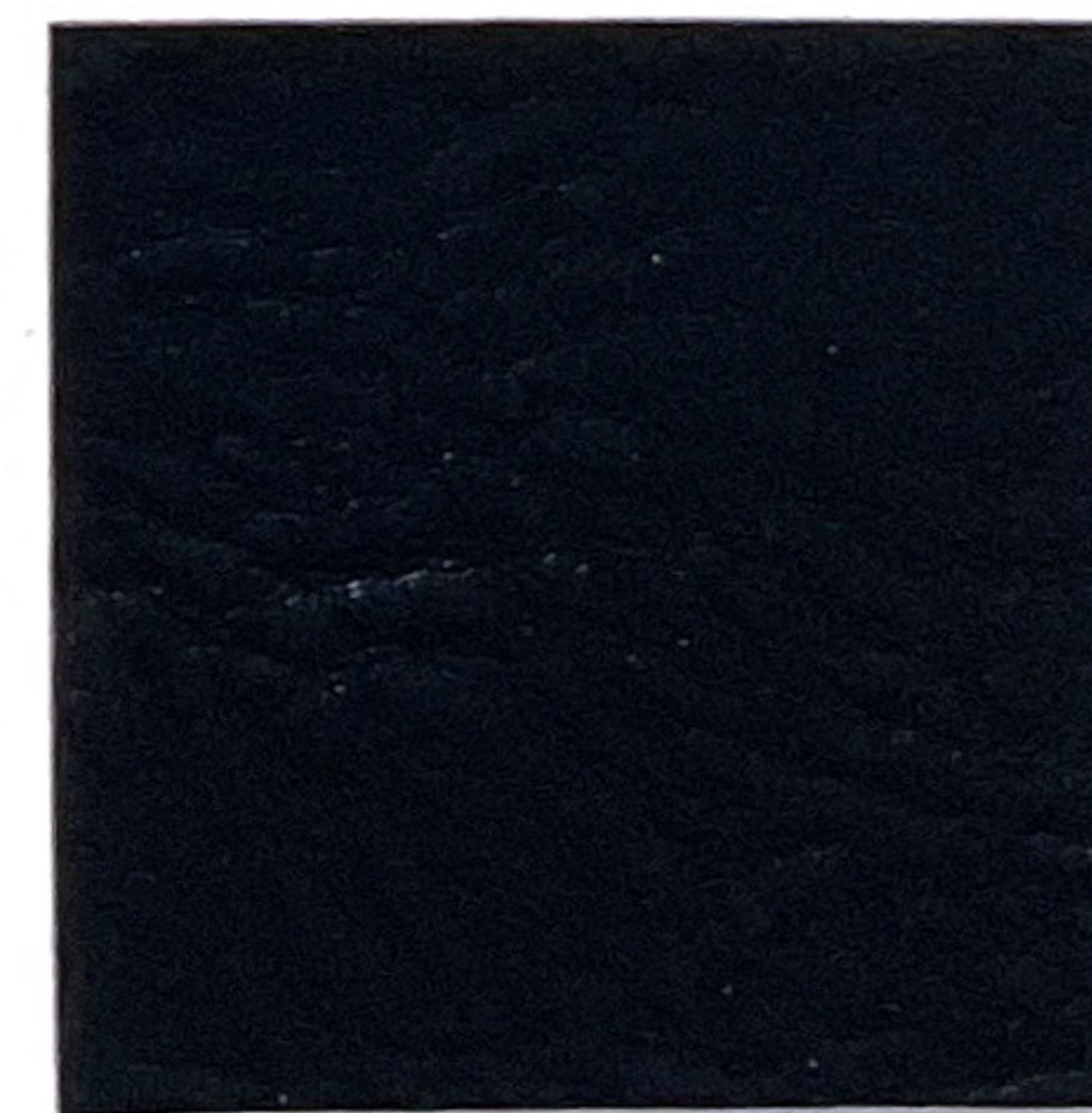
BRK 43 Black