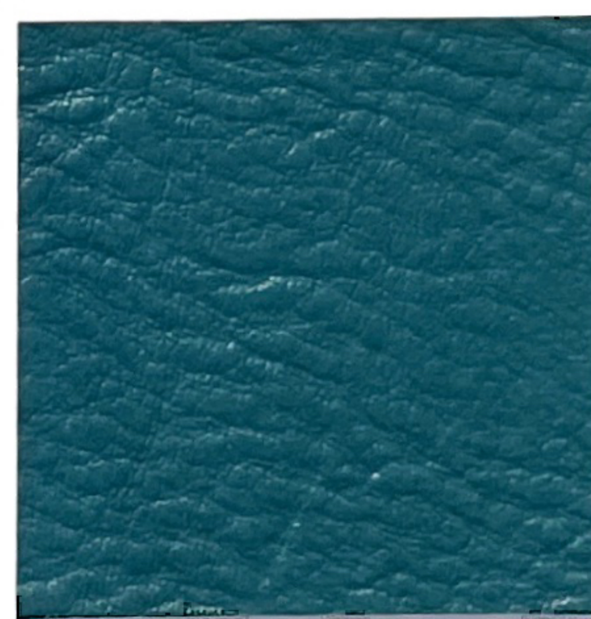
BRK 85 Teal