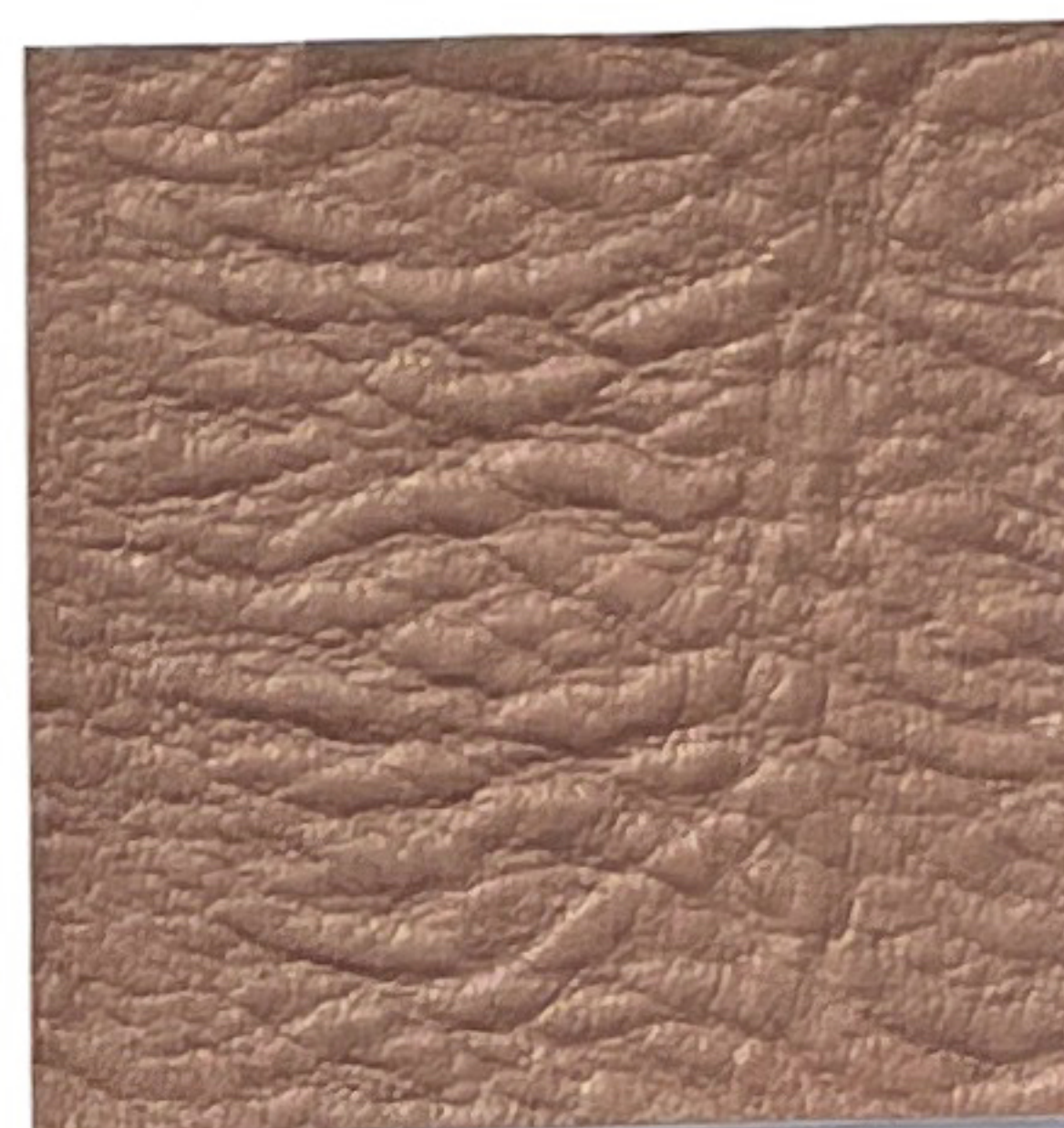
BRK 83 Rosewood