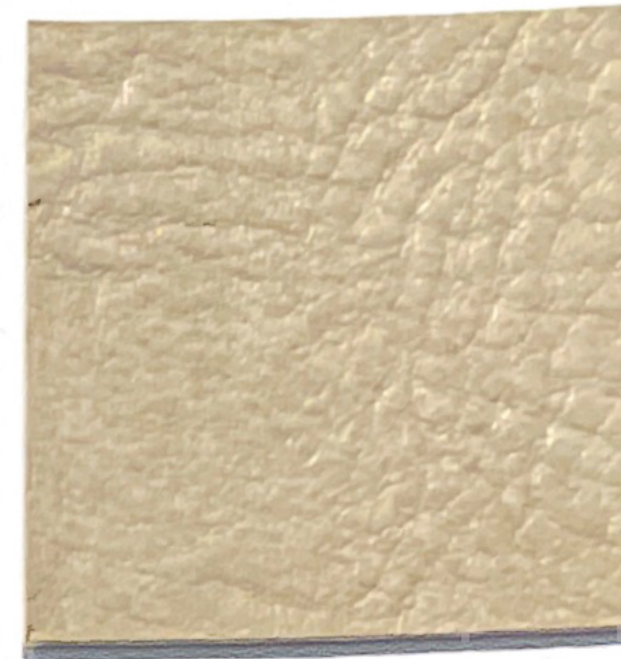
BRK 84 Neutral