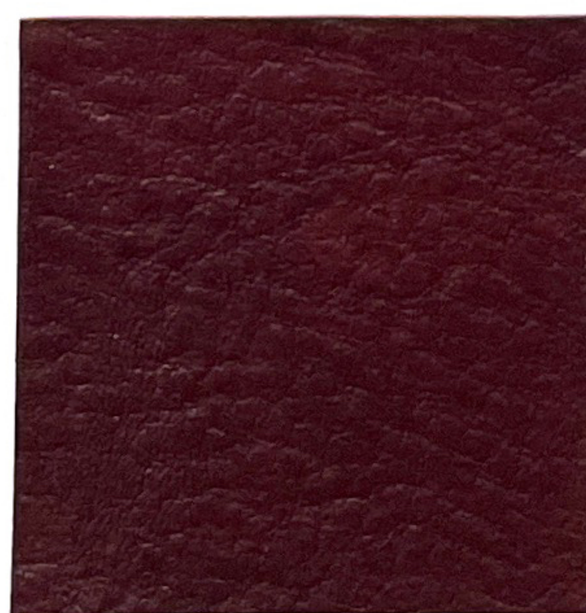
BRK 40 Burgundy