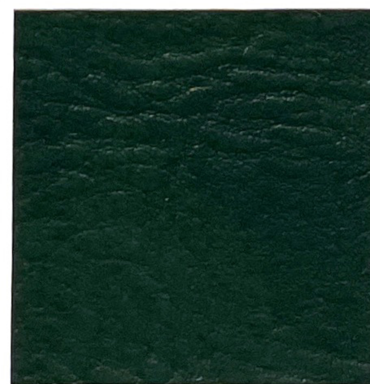
BRK 36 Forest