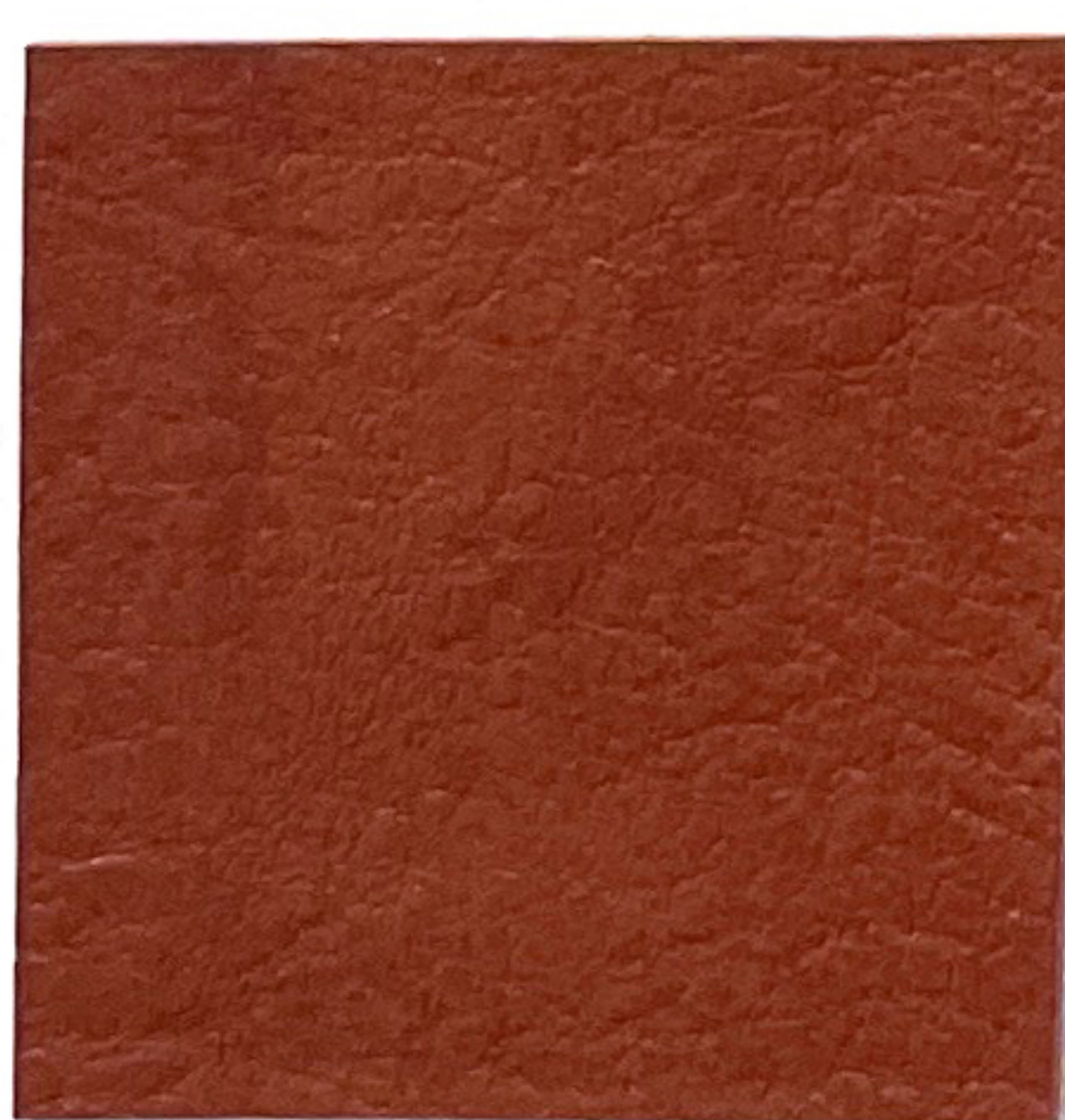
BRK 31 Earth