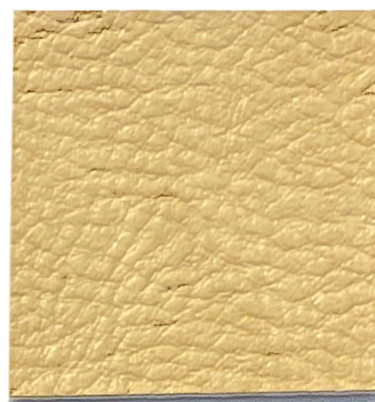
BRK 81 Honey