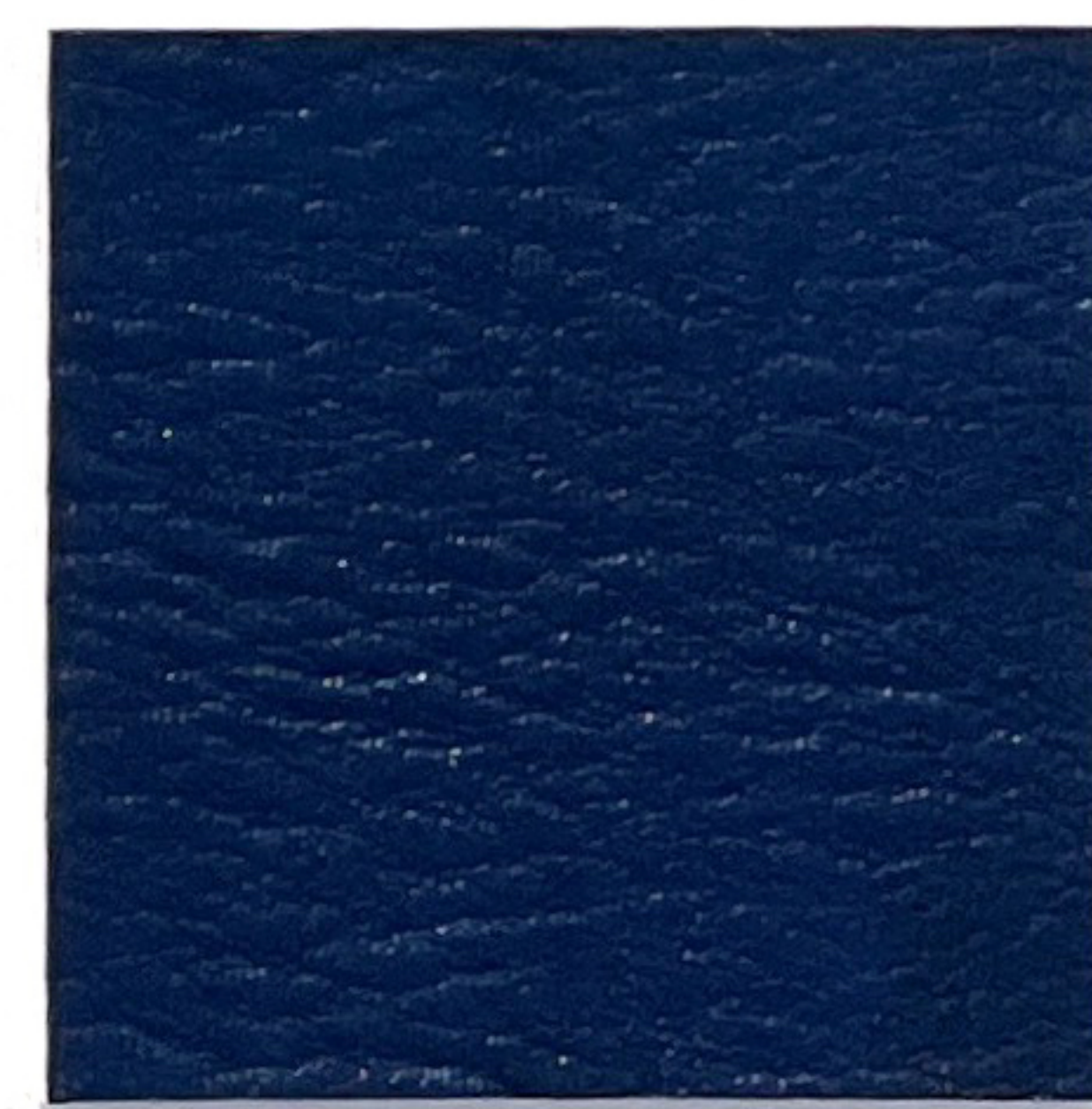
BRK 38 Navy