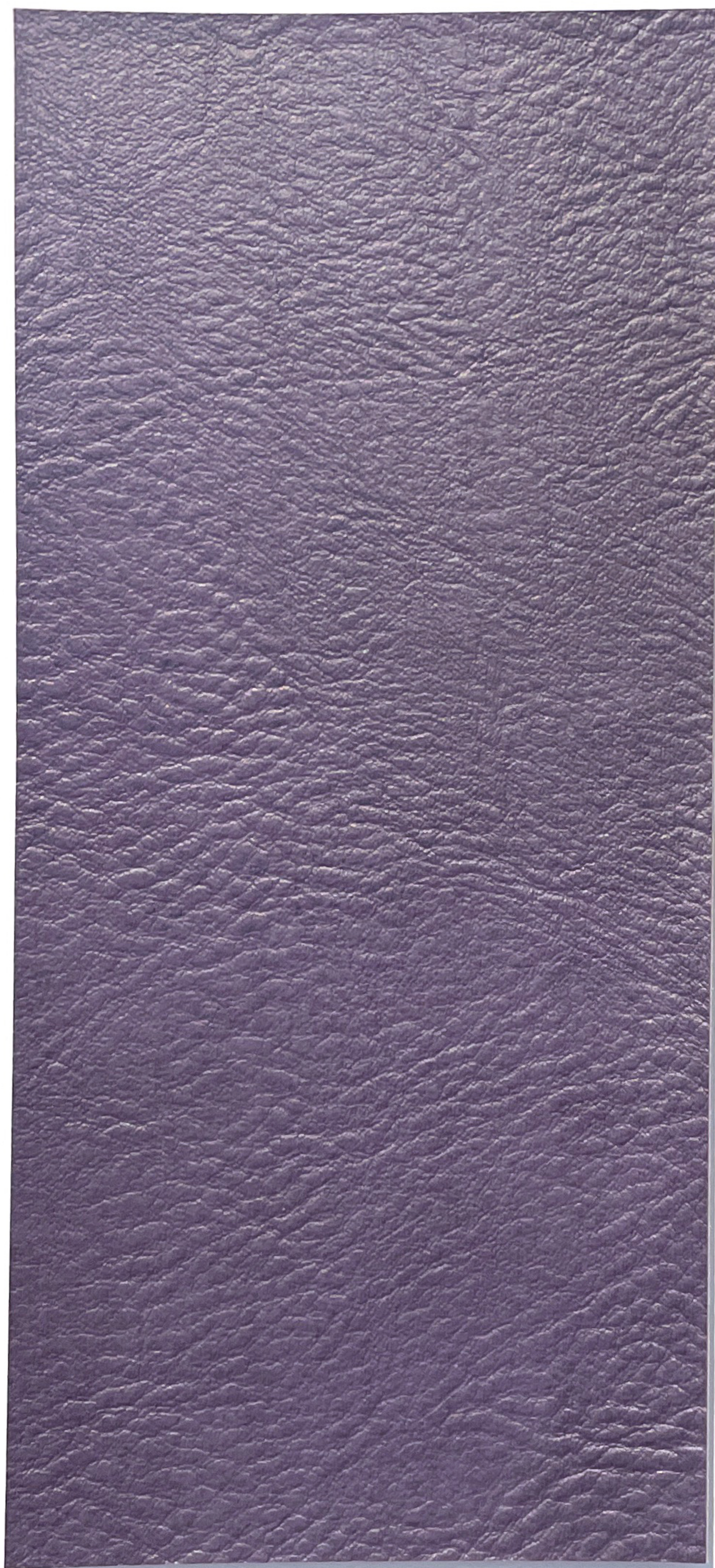
BRK 80 Wood Violet