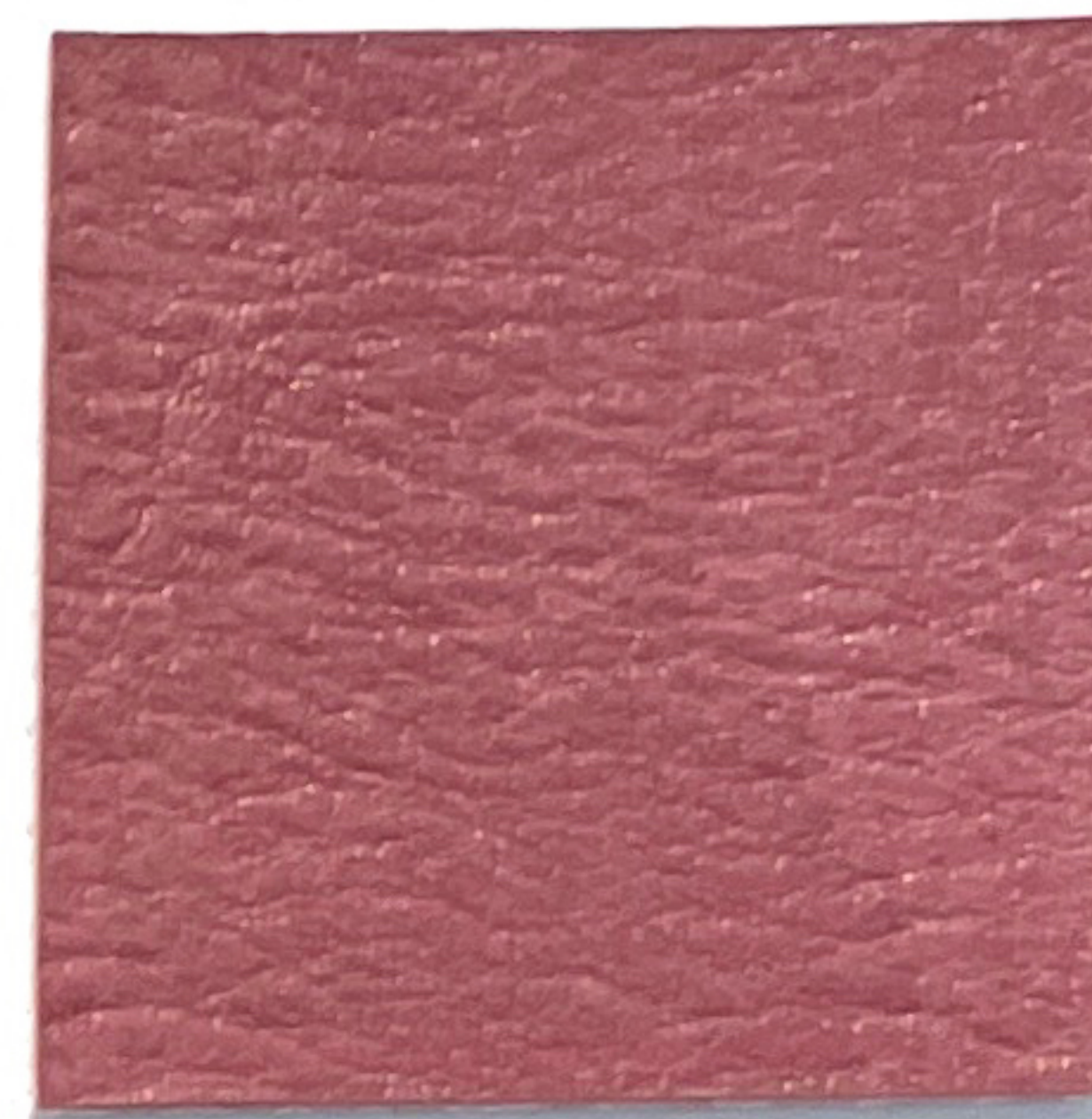
BRK 86 Strawberry