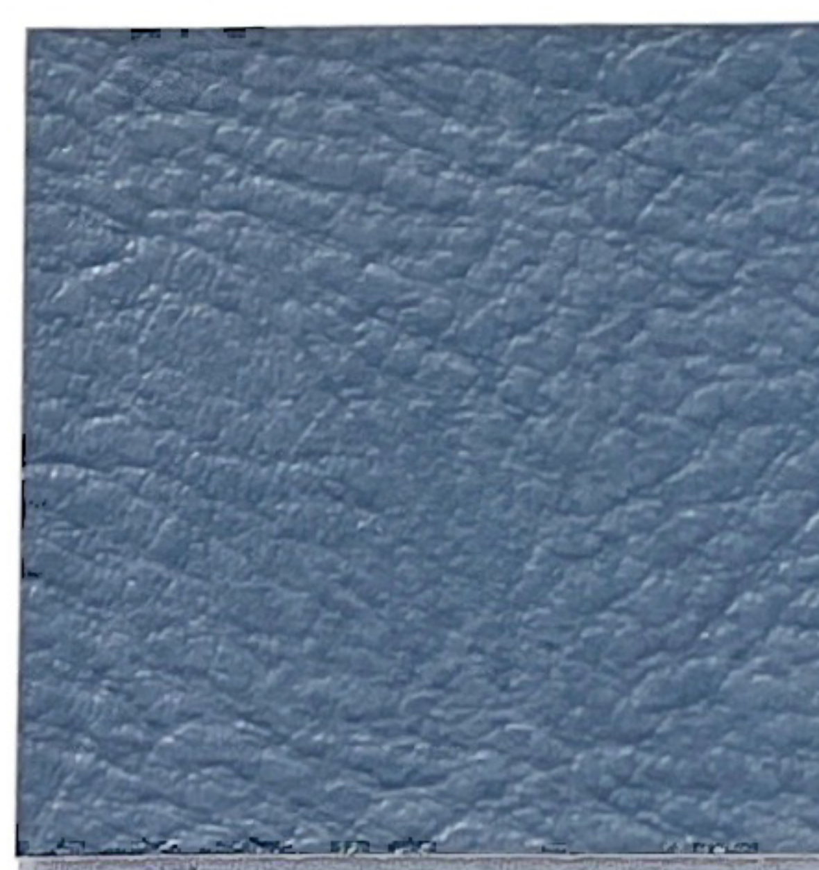
BRK 82 Baltic Blue