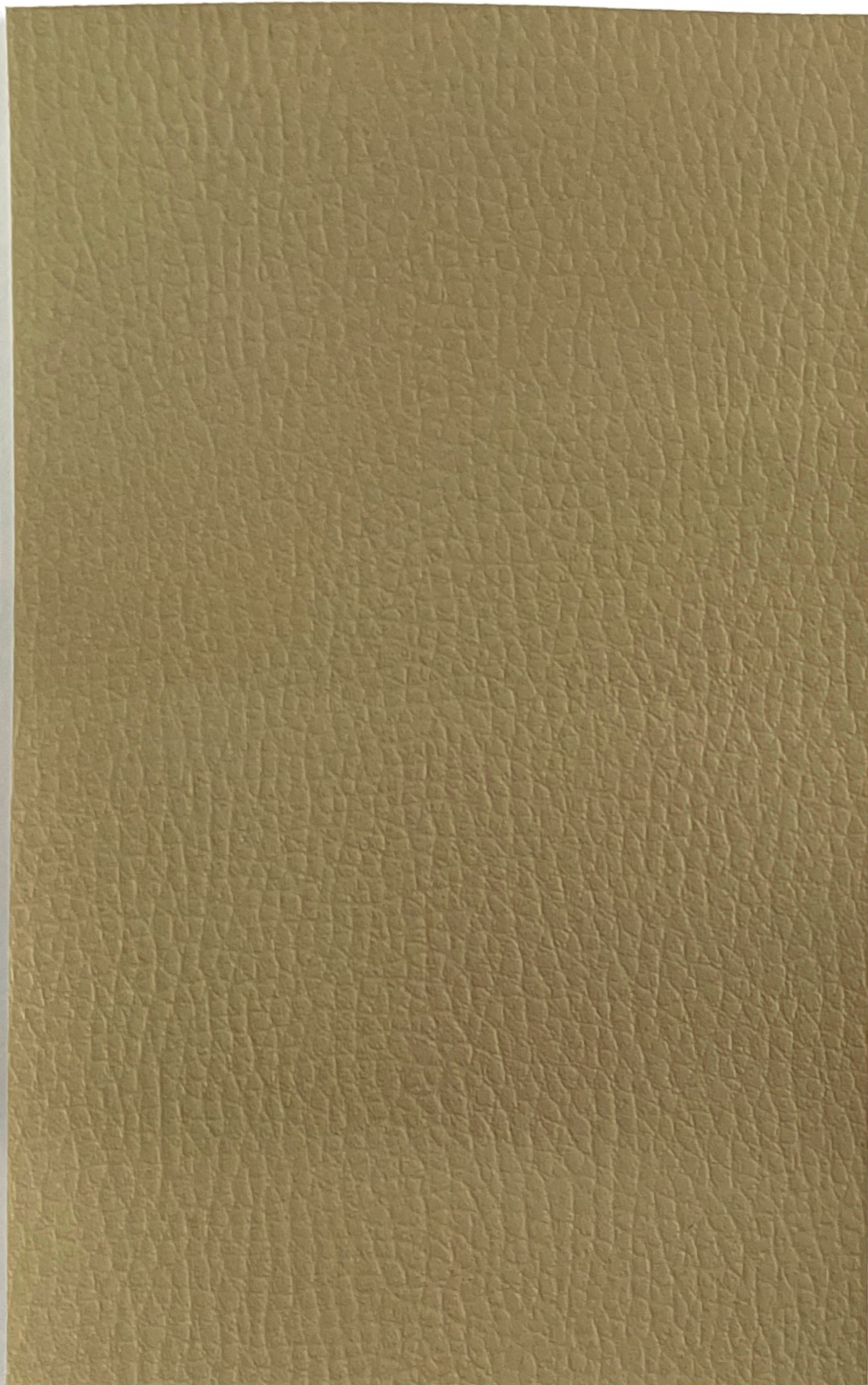
AL 40 Malt