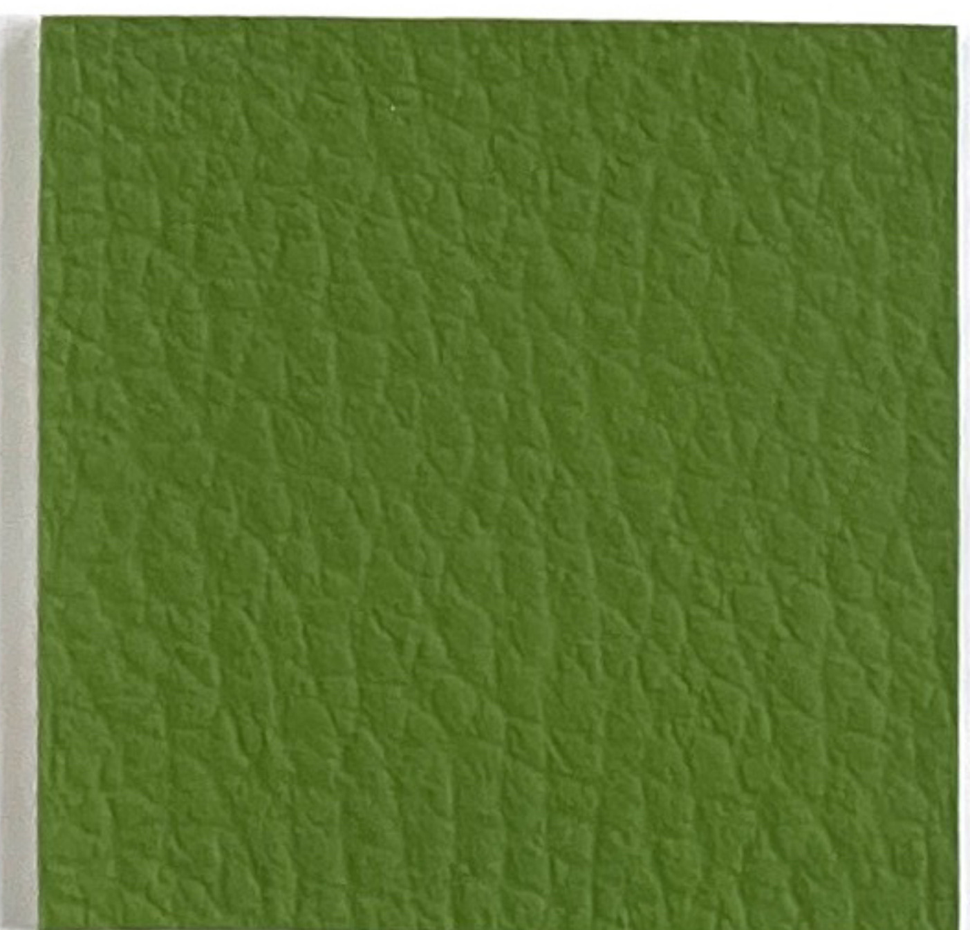
AL 41 Mill Green