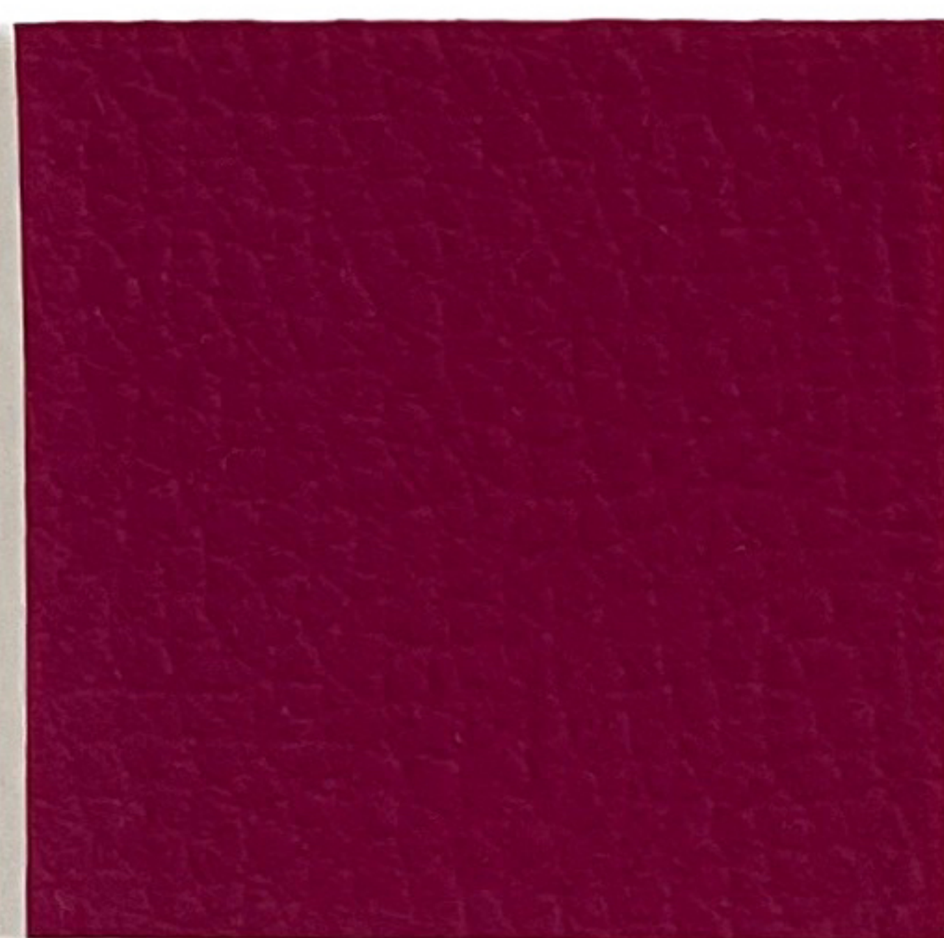
AL 38 Cranberry