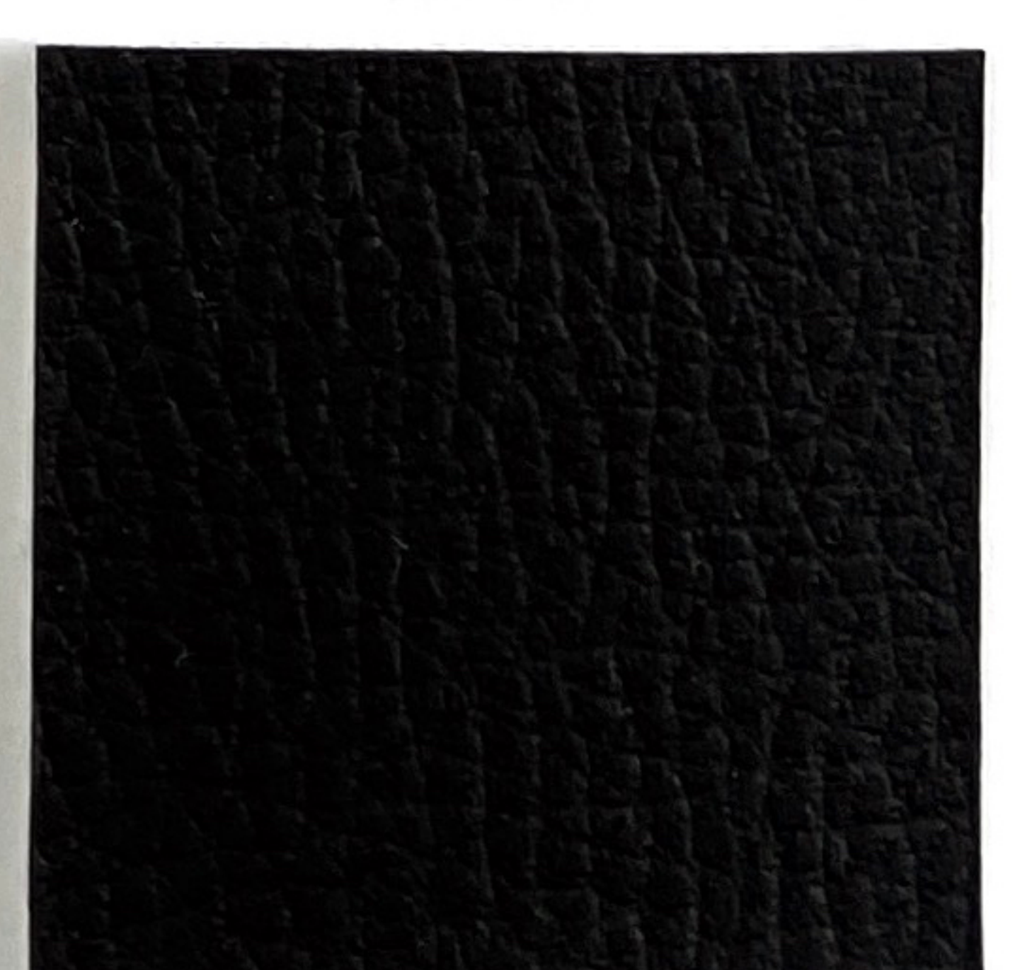
AL 42 Nocturnal