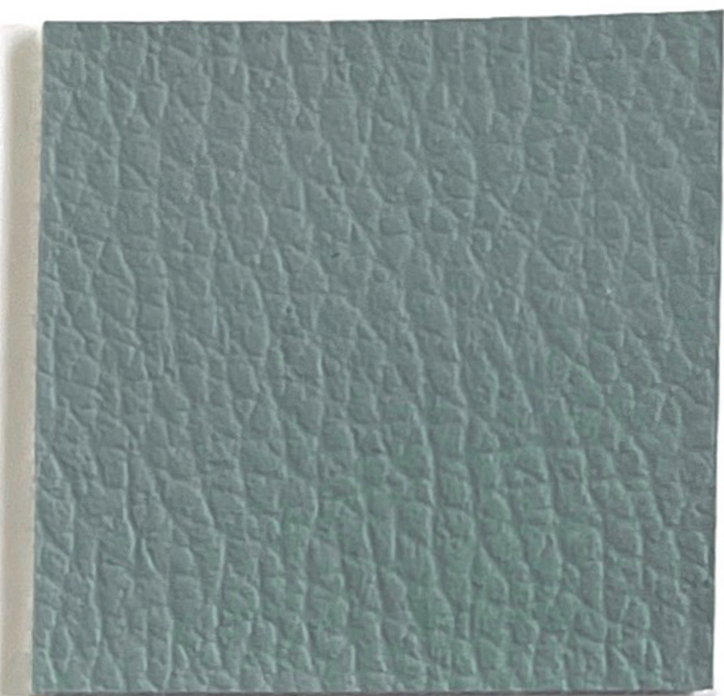
AL 39 Harmony