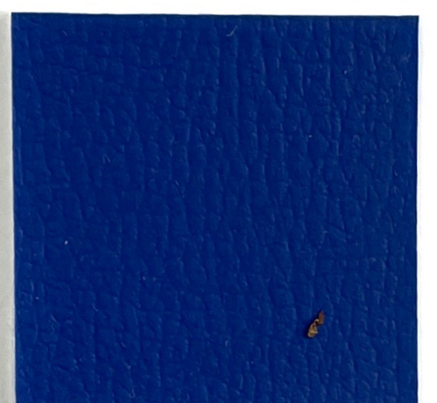
AL 46 True Blue