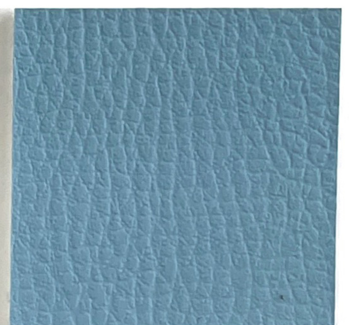
AL 35 Bayside