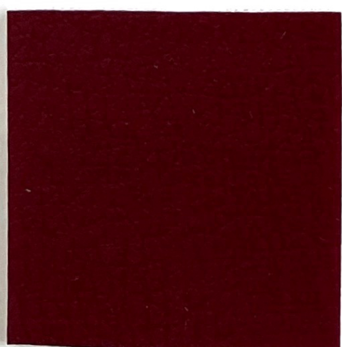
AL 43 Ruby