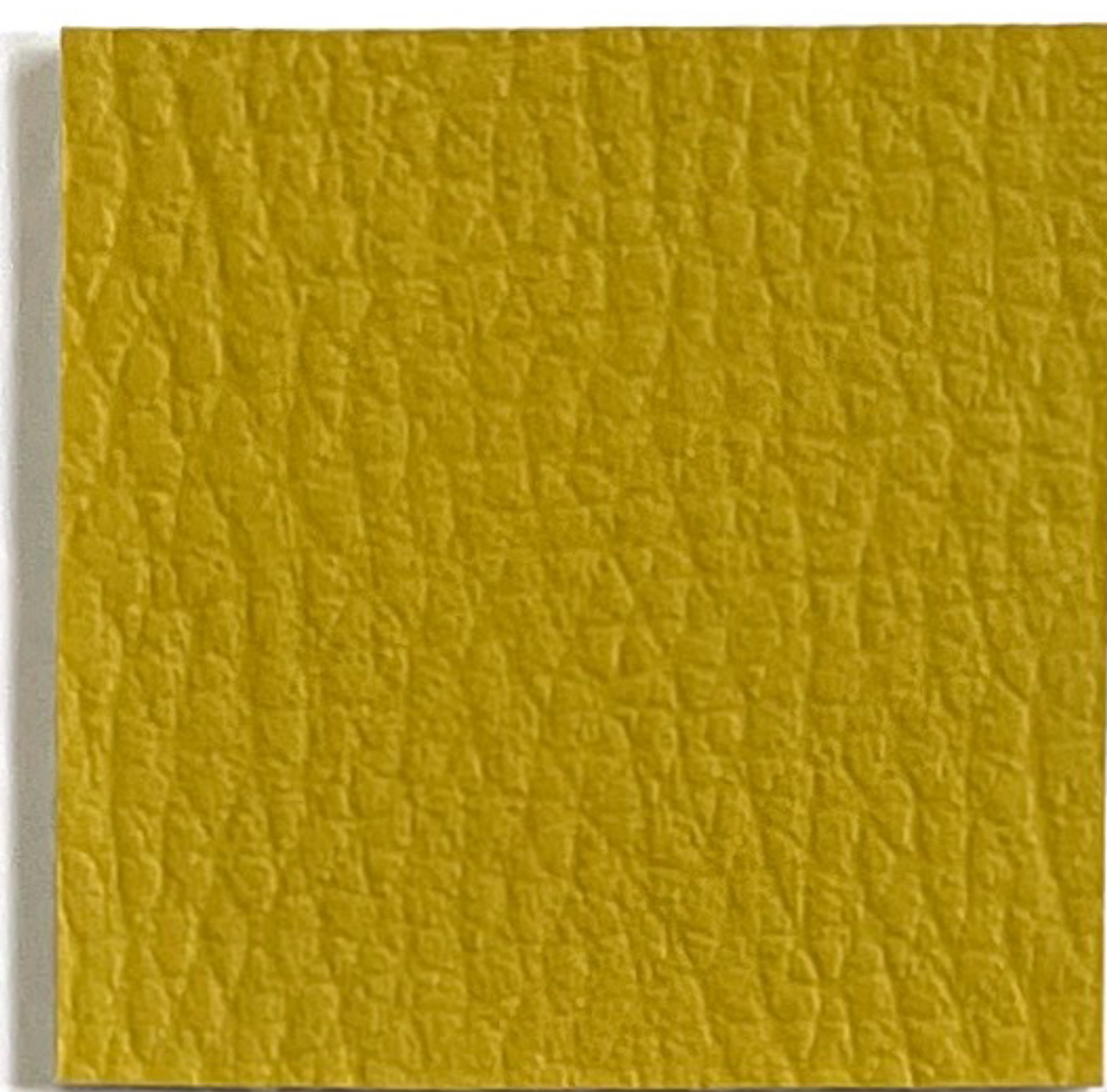
AL 48 Autumn Glade