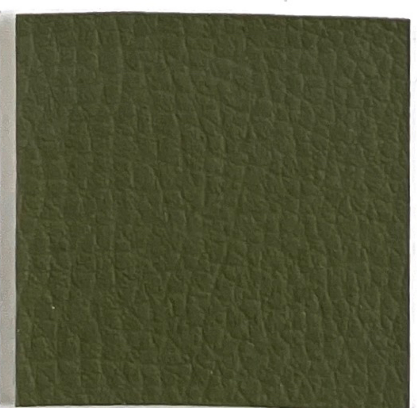
AL 36 Soap Stone