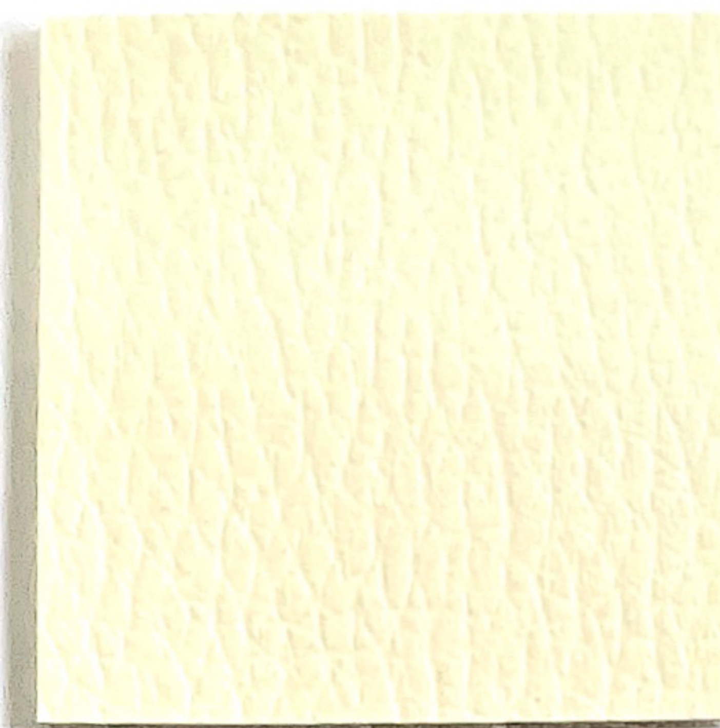
AL 45 Tonic