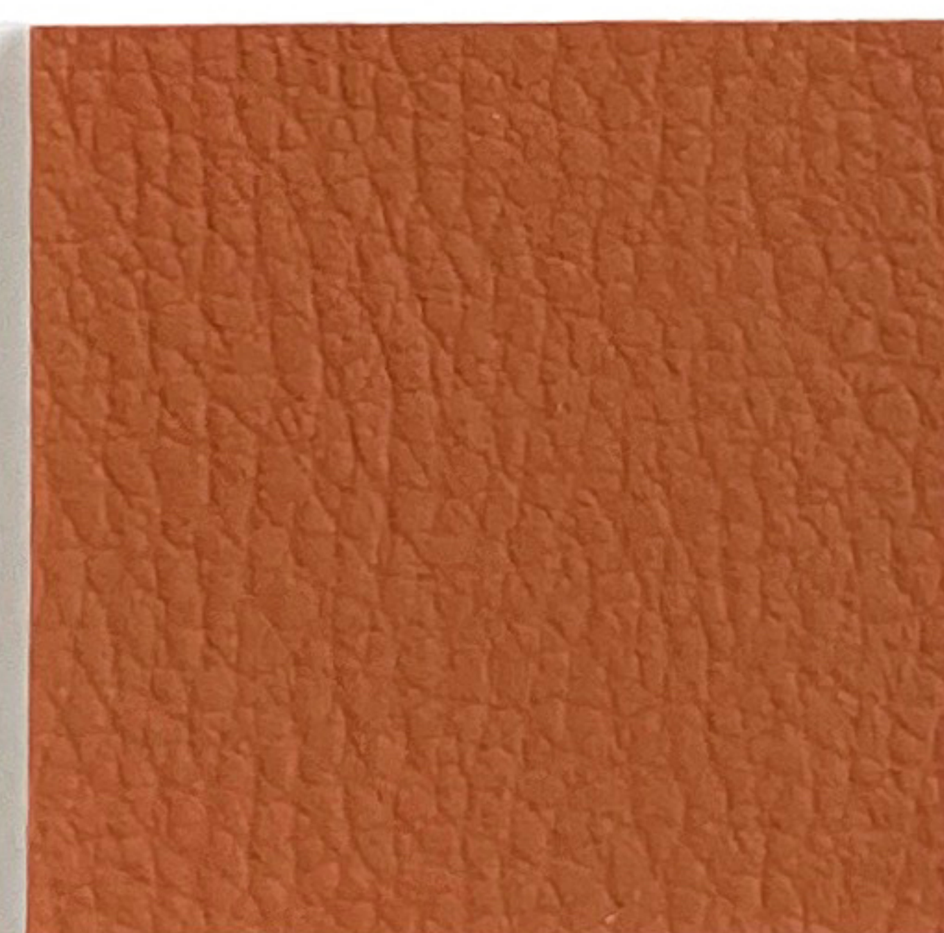
AL 37 Clay Dust