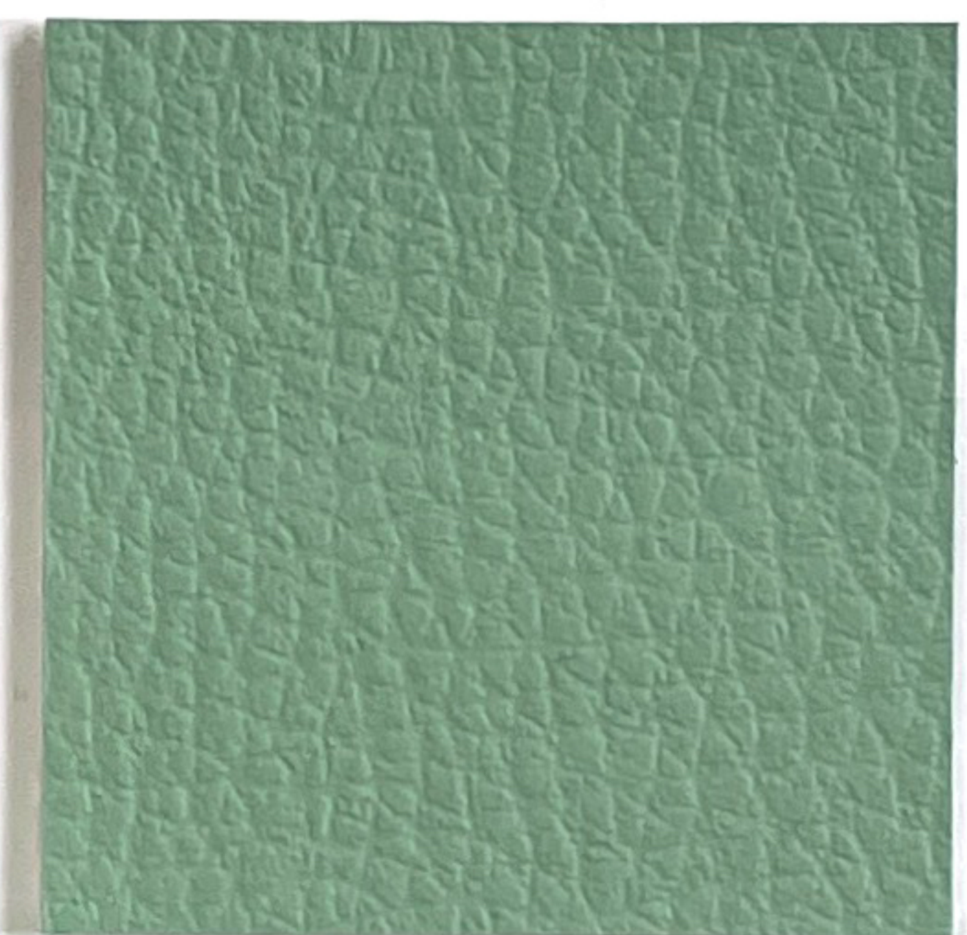
AL 34 Sage